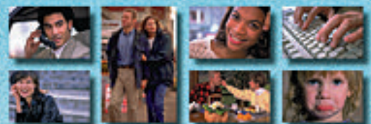
PEOPLE & LIFESTYLES VOLUME 2

PRODUCTION TIPS FOR PREPRESS AND PRODUCTION