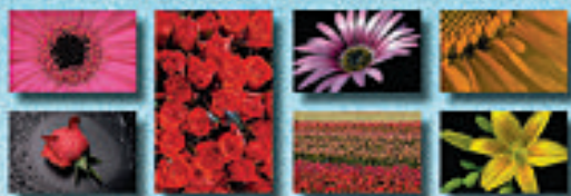
FLOWERS VOLUME 1

A MUST FOR GRAPHIC DESIGNERS AND DESKTOP PUBLISHERS