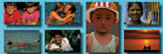
PEOPLE & LIFESTYLES VOLUME 1

WIDE SELECTION OF PEOPLE, CITIES, SCENES AND BACKGROUNDS