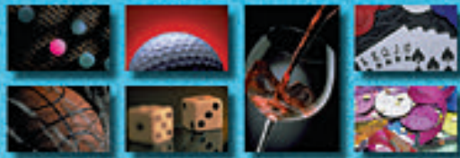
BACKGROUNDS & TEXTURES VOLUME 3

ENHANCE GRAPHIC DESIGN AND MULTI- MEDIA PRESENTATIONS