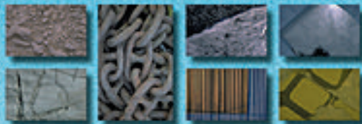
BACKGROUNDS & TEXTURES VOLUME 4

WIDE SELECTION OF PEOPLE, CITIES, SCENES AND BACKGROUNDS