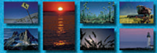
LANDSCAPES & SCENERY VOLUME 1

PROFESSIONAL STOCK PHOTOGRAPHY ON CD-ROM