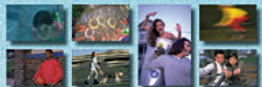
PEOPLE & LIFESTYLES VOLUME 3

A MUST FOR GRAPHIC DESIGNERS AND DESKTOP PUBLISHERS