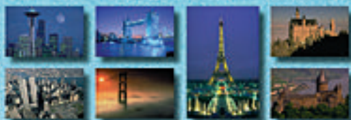
CITIES & CASTLES VOLUME 1

PRODUCTION TIPS FOR PREPRESS AND PRODUCTION