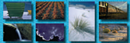
LANDSCAPES & SCENERY VOLUME 2