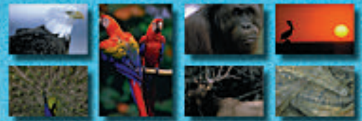
NATURE & ANIMALS VOLUME 1

ENHANCE GRAPHIC DESIGN AND MULTI- MEDIA PRESENTATIONS