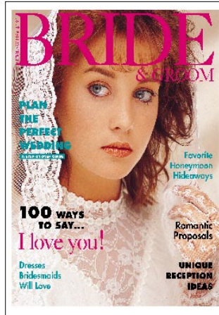
A4-size (210 x 297 mm)