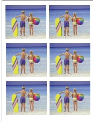
A-size (8.5 x 11 in.)