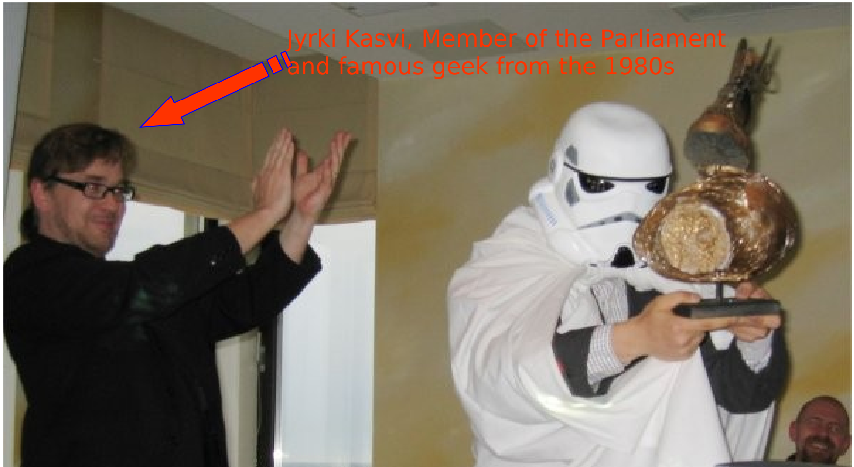
Jyrki Kasvi, Member of the Parliament and famous geek from the 1980s