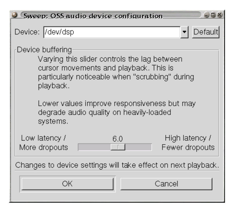
Figure 3: Sweep's device buffering configuration

For the sake of portability and acceptable behaviour when running stock kernels, it was necessary in Sweep to introduce some visual feedback of the delay caused by device buffering. During playback, Sweep displays two cursors simultaneously, as shown in Figure 4 : the white cursor to the right is under the user's control, and can be moved by the transport controls and the scrub tool; the green cursor to the left always displays the position of the audio that can currently be heard. Hence if the user scans or scrubs through the file, the white cursor is moved immediately but the green cursor may lag slightly due to buffering in the audio device, and due to motion smoothing introduced by the modelling of momentum. Thus the user has a true representation of their influence over the playback position, and is not misled by contradictory audio and visuals. This also provides an obvious visual representation of the application latency, which is otherwise a fairly abstract concept.