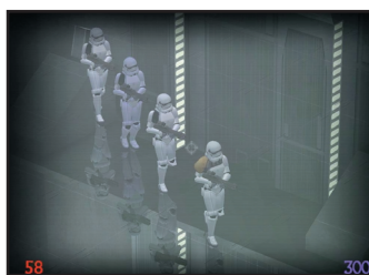
These aren't the droids you're looking for.

> WITH OVER 70,000 Australians officially declaring their religion as Jedi in a recent census, there can be no doubt as to the popularity of the Star Wars mythology. While they don't directly relate to the events of the Star Wars films, the Jedi Knight games are similarly based a long time ago in galaxy far, far away. Playing as Jedi Kyle Katarn you make use of a range of weapons in your efforts to defend the galaxy, including the ubiquitous lightsaber, which can be used to attack enemies and stave off projectiles. Being a Jedi, you can also draw on your mastery of the force to perform acrobatic leaps, topple enemies with a force push and, of course, confuse