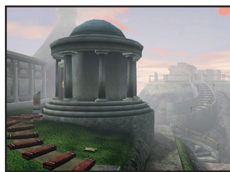
realMYST is full of stunning vistas.

> RELEASED IN 1993, the original Myst went on to be one of the bestselling games of all time. The blend of stunning 3D-rendered imagery and grown-up puzzle elements gave it a broad appeal. In retrospect, the use of static pre-rendered imagery couldn't compete with the immersive environments seen in modern 3D games. realMYST is the version of Myst the developers had dreamed of making, but is only possible now with modern fast processors and dedicated 3D hardware. Rather than a series of