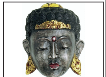
Photo-Objects can be exported to DTP, word processing or Web applications.

HEMERA IS one of the leading providers of royalty-free images for designers, business users and consumers. Hemera's Photo-Objects is a collection of images of people, animals and objects that have been cut out from their backgrounds. This saves you time and means that all of the objects can be dropped into documents, without having to create your own mask.