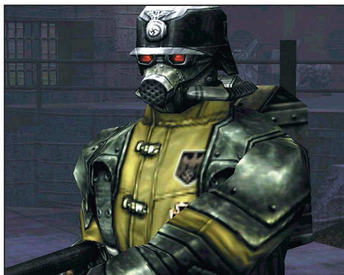
Return to Castle Wolfenstein blends historical fact with supernatural elements.

> WORLD WAR II nostalgia has been popular in recent years, with films like Saving Private Ryan , the series, Band of Brothers , and Medal of Honor PC and console games. While the former opted for a historical accuracy, Return to Castle Wolfenstein takes an alternative twist on the events of the Second World War.